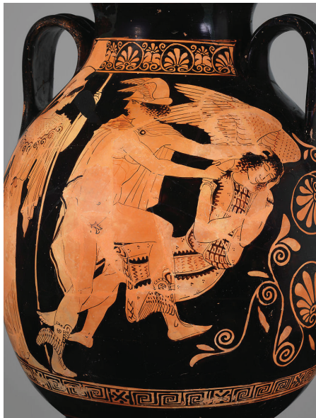
IMAGE CREDIT: Terracotta pelike (jar) Attributed to Polygnotos_ca. 450–440 BCE Greece Metropolitan Museum of Art

What similarities do you notice among the depictions? What differences do you notice? How might you imagine Medusa based on these images and how she is described in the Live from Mount Olympus podcast?