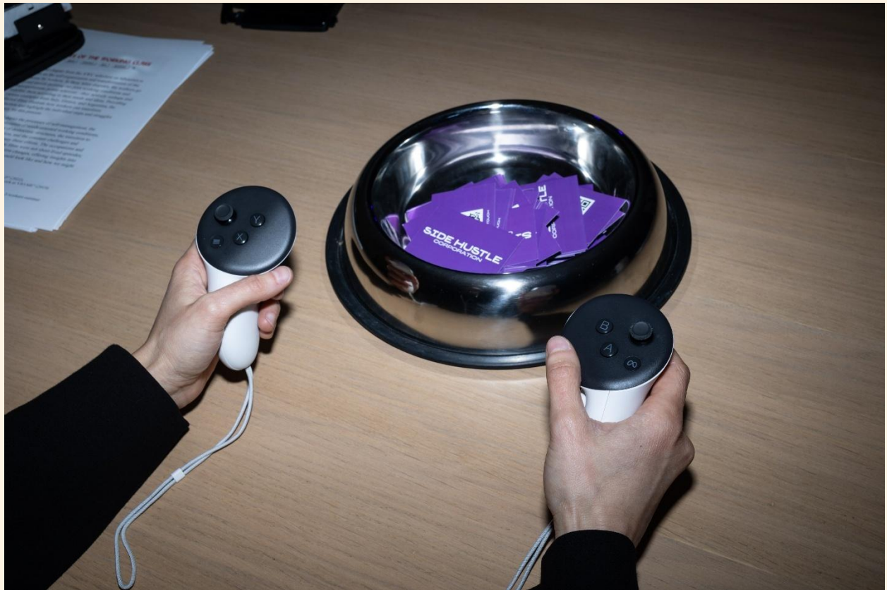
Image 6 Side Hustle by ESTO Association ONX/ AIR OPEN DAYS