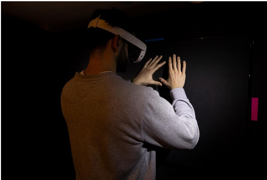
Image 5 Solastalgia XR by Collective Continuum ONX/ AIR OPEN DAYS