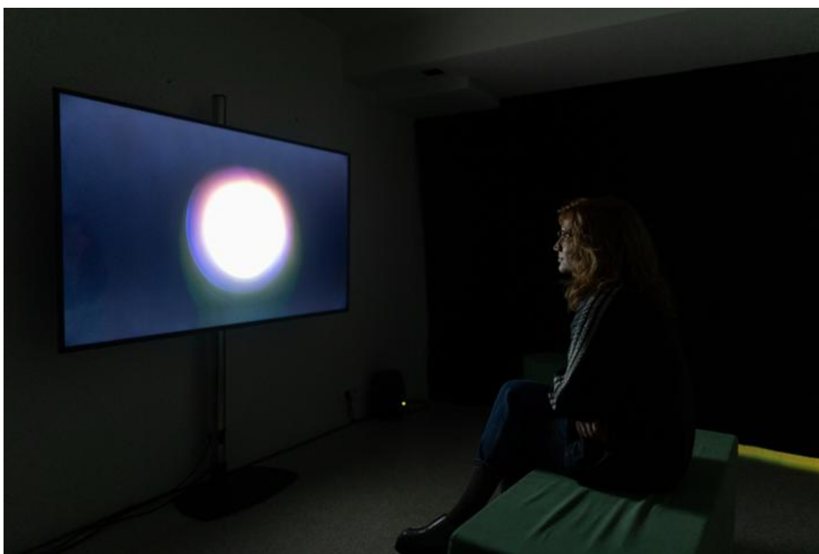
Image 10 A Sense of Time by Stratos Bichakis ONX/ AIR OPEN DAYS