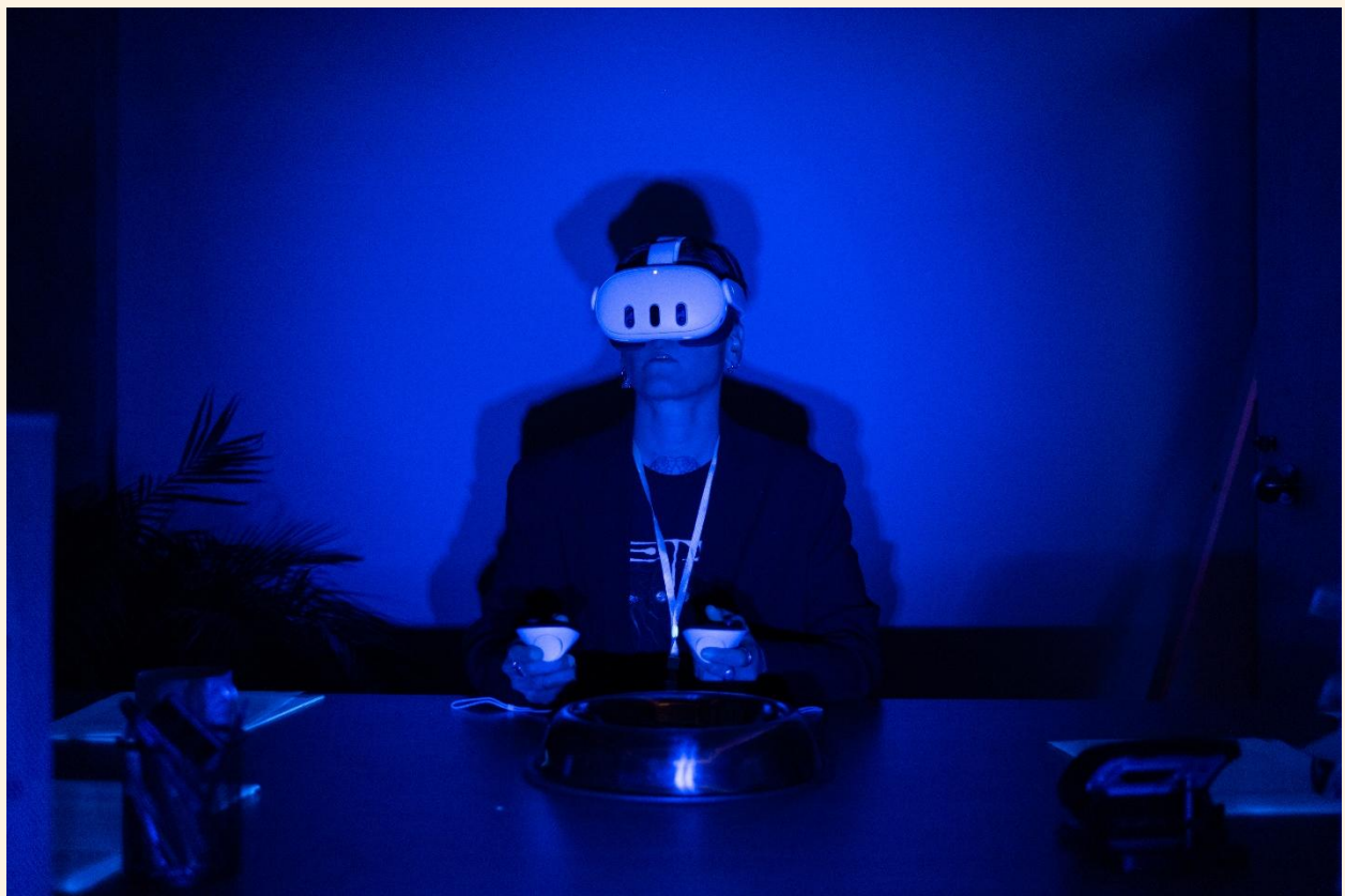
Image 1 Side Hustle by ESTO Association ONX/ AIR OPEN DAYS