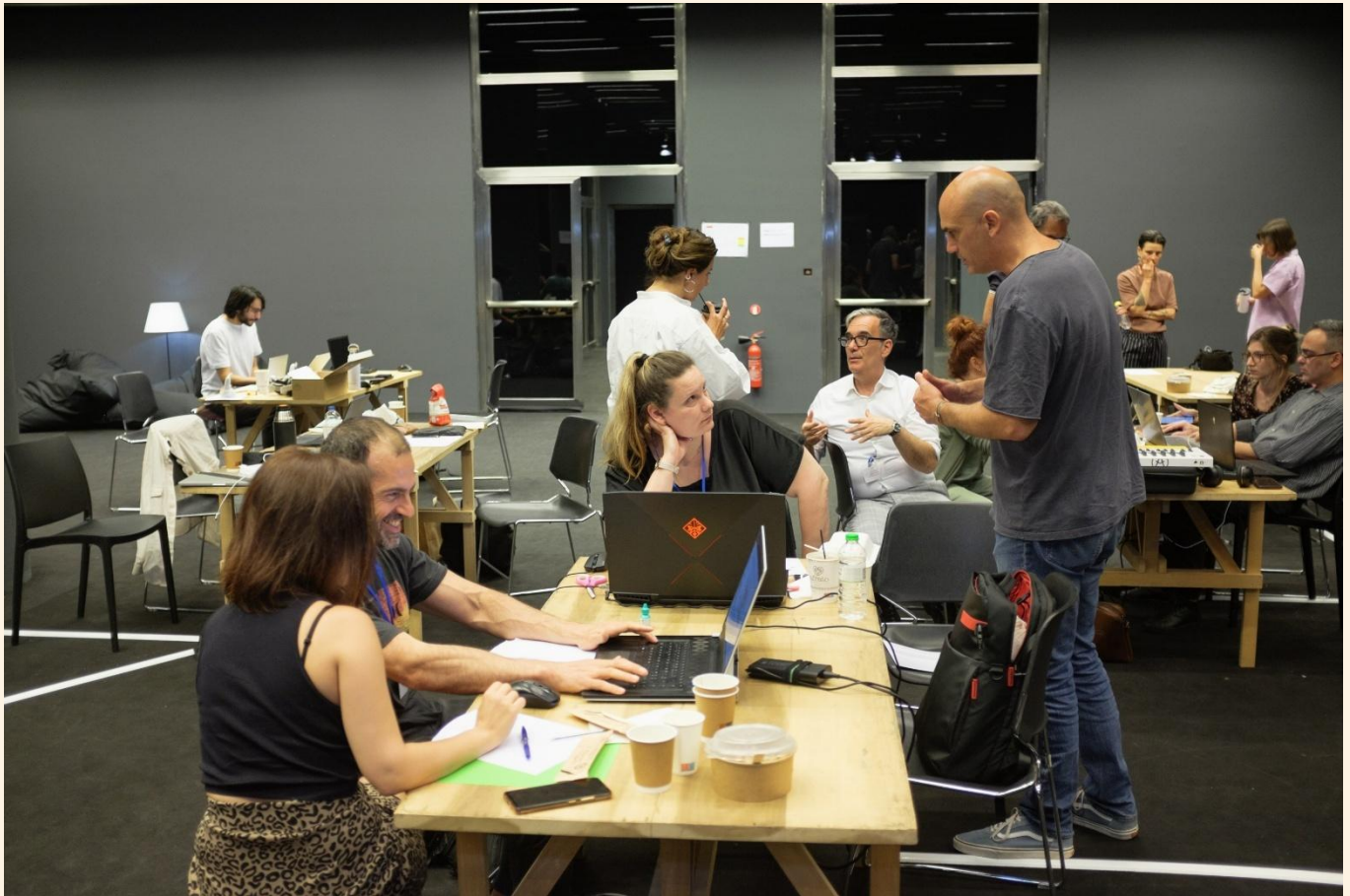
Image 8 ONX Immersive Proof-of-Concept